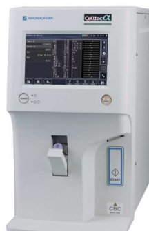
MEK-1302 (open and closed mode)