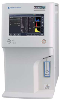
MEK-1301 (open mode only)

Celltac α has 2 different models; MEK-1301 and MEK-1302. MEK-1301 has open measurement mode and MEK-1302 has both open and closed measurement modes.